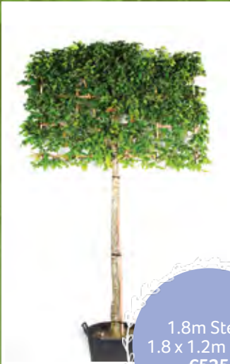
Hornbeam Espalier Tree