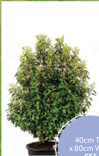
Portuguese Laurel Hedging Plant