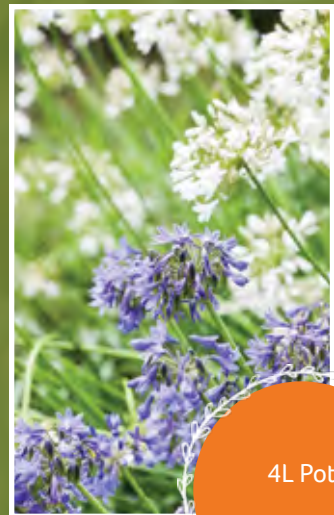
Agapanthus Blue & White