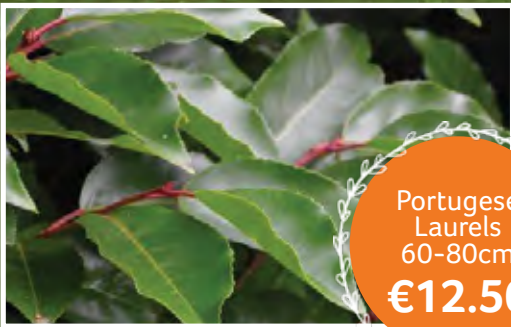
Portugese Laurels 60-80cm €12.50