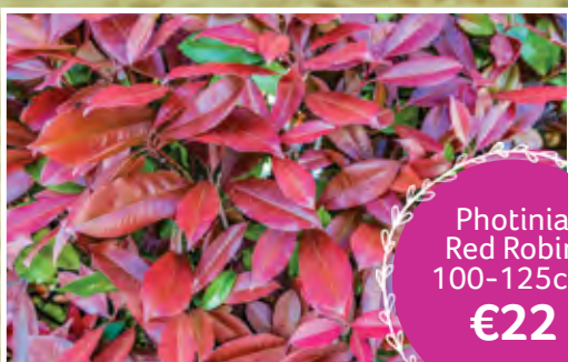
Photinia Red Robin 100-125cm €22