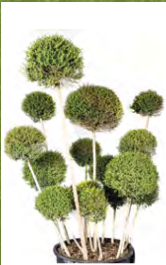
Ligustrum Multi Ball Specimen