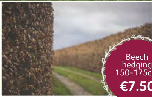
Beech hedging 150-175cm €7.50