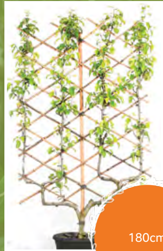
Fruit Candelabra Available in Apples & Pears