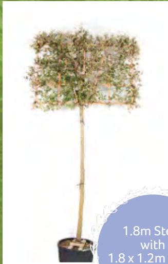
Evergreen Oak Espalier Tree