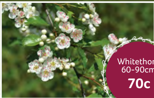
Whitethorn 60-90cm 70c