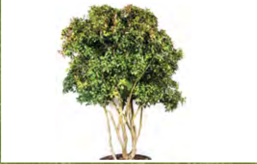
Osmanthus Multistem Evergreen Parachute Form