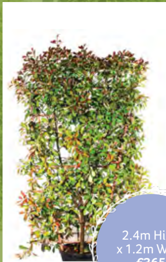
Photinia Red Robin Espalier