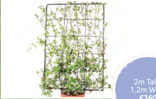
Evergreen Jasmine Frame