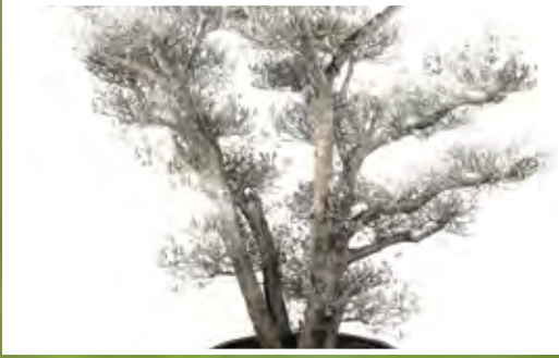
Olive Bonsai Form