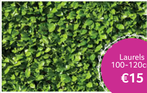
Laurels 100-120cm €15